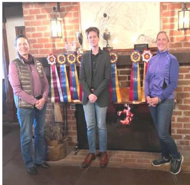
VADA-CH 2023 Year End Awards